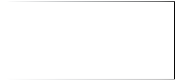
Figure 1: Central tympanum. Vézelay Abbey, Burgundy, France, 1130.